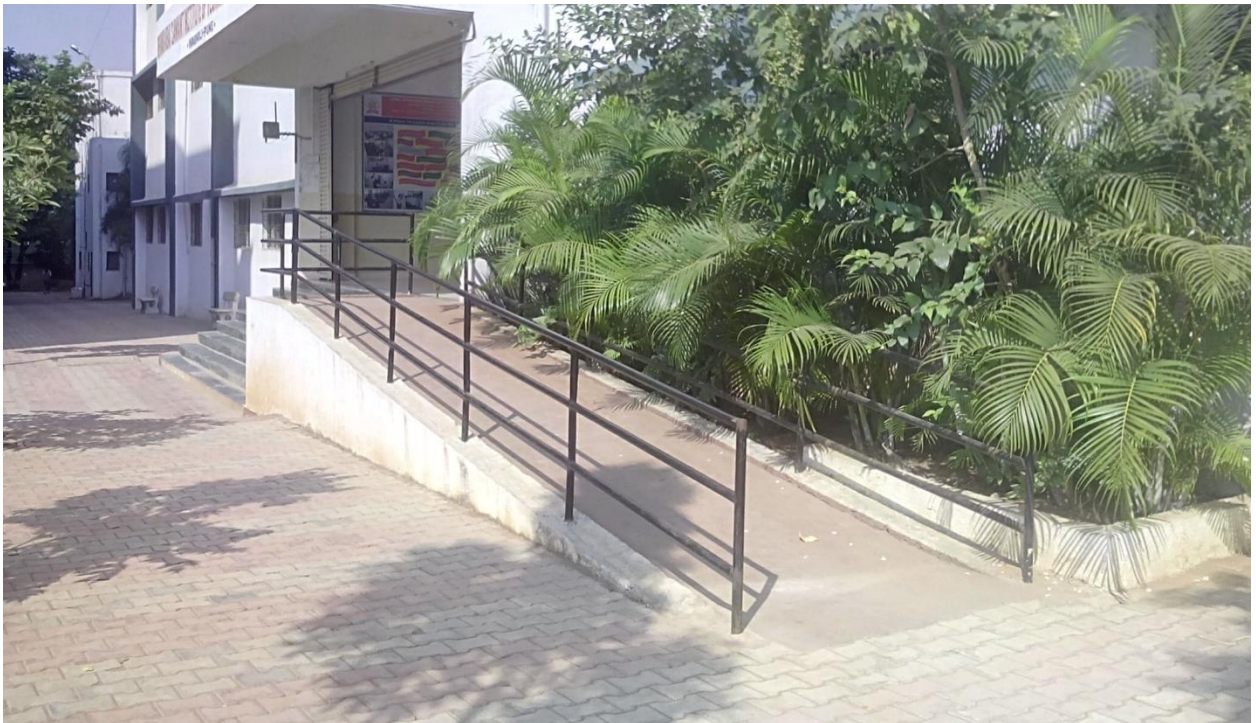
1. Snapshots of ramps in Institute