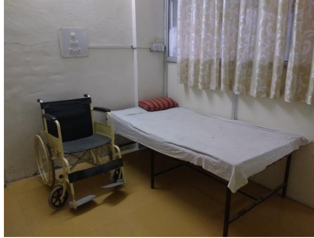
4. Rest room and Wheel Chair