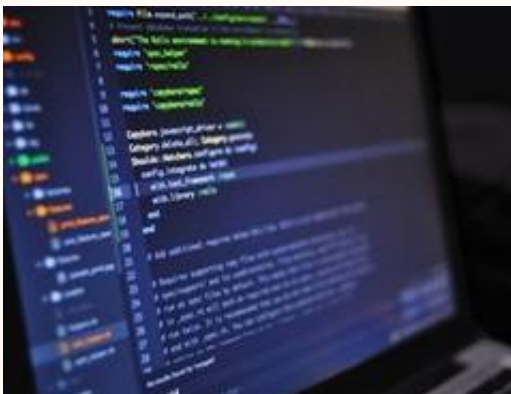
C And C++ WorkShop