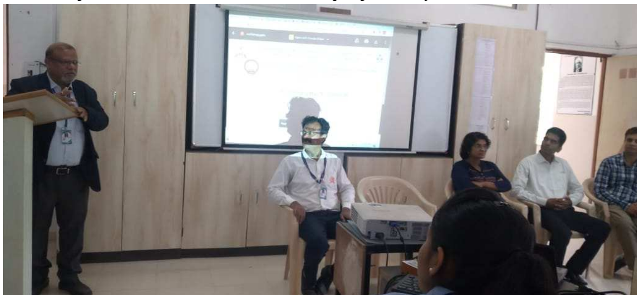
Principal Nagaraj sir motivated students to improve communication skill and participate in various workshops.