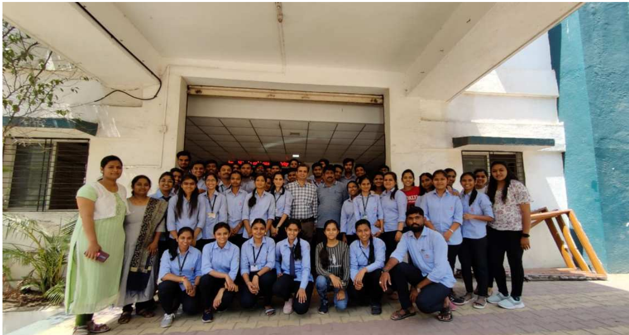
Participants of workshop